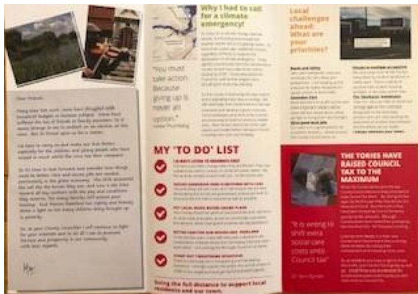
Pix 4 Part of my Election Leaflet 2021

I'd like to thank all those who kept in touch through that difficult year and most of all those who voted for me to serve another four years on 6 th May 2021.