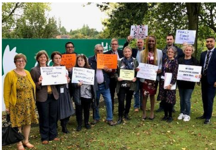
Pix 3 Campaigning outside County Hall before Covid!